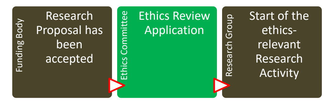
Figure 1 Time Schedule

All requests for advice on the ethical correctness of research projects (and publications) are submitted in writing to the ERP (including all necessary documentation) in line with the time schedule of the funding agency, at least, however, before the start of any research activity to which the ethics approval application refers (Fig. 5). Ethics approval by the ERP will not be granted retrospectively. There are no limits for amendments in the application.